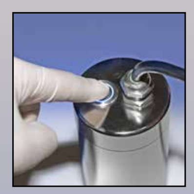
LumiStar1000 USL 13/33 with programmable on/off switch.

Example: LumiStar1000 Luminaire Stainless Steel USL33, 24V/12W