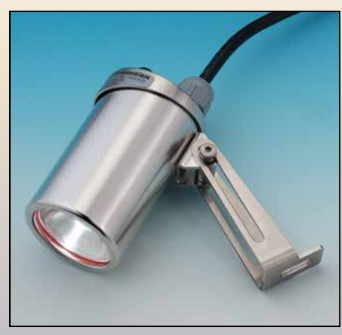
LumiStar1000 Luminaire Series USL13 with Mounting Bracket