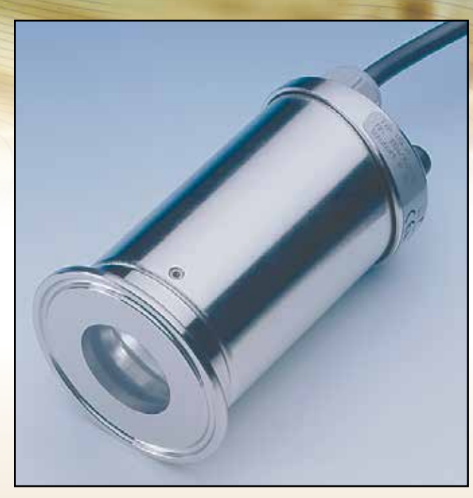
LumiStar1000 Luminaire Series USL33 with MetaClamp® Sanitary Clamp Connection